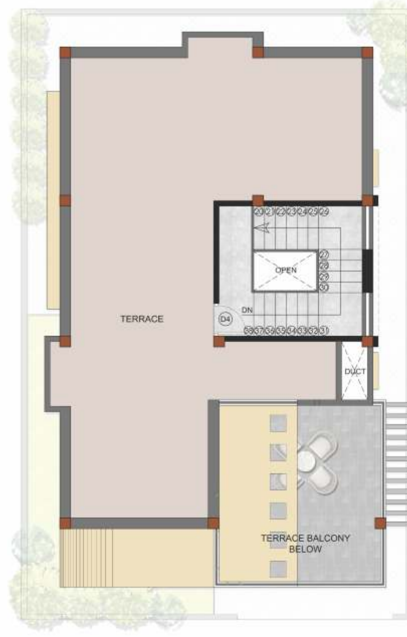
Terrace Floor Plan