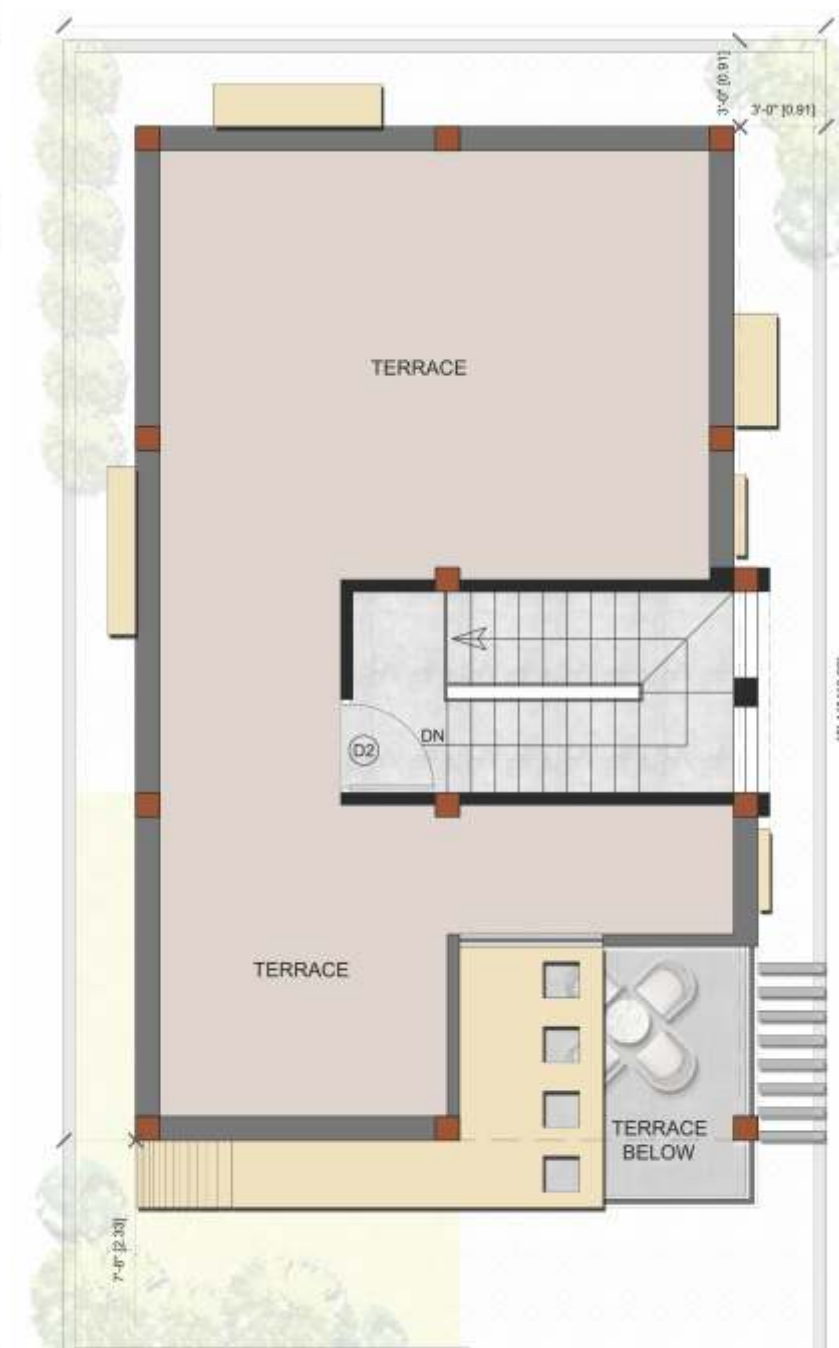
Terrace Floor Plan